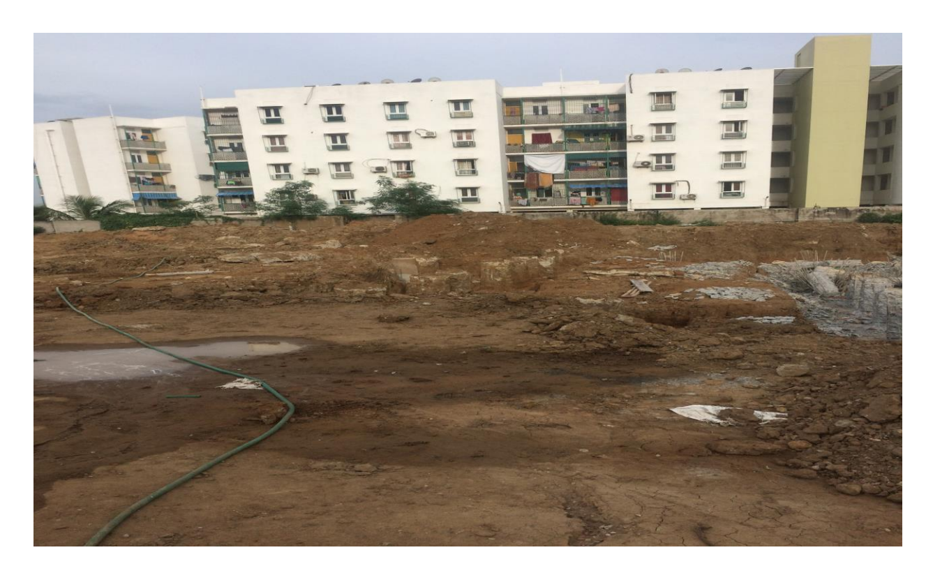
In Block D1 Pilling Work in Process

In Block B2 Excavation Work for Pile Cap Works on process.