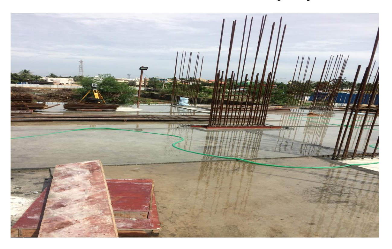
In Block D2 -Shuttering & Bar bending Works on Progress for Second half of First Floor Level Slab