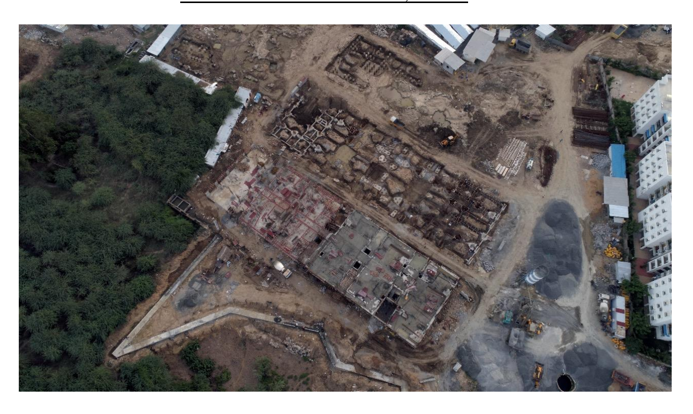
VIEW OF TYPE D - BLOCKS D1 , D2 & D3